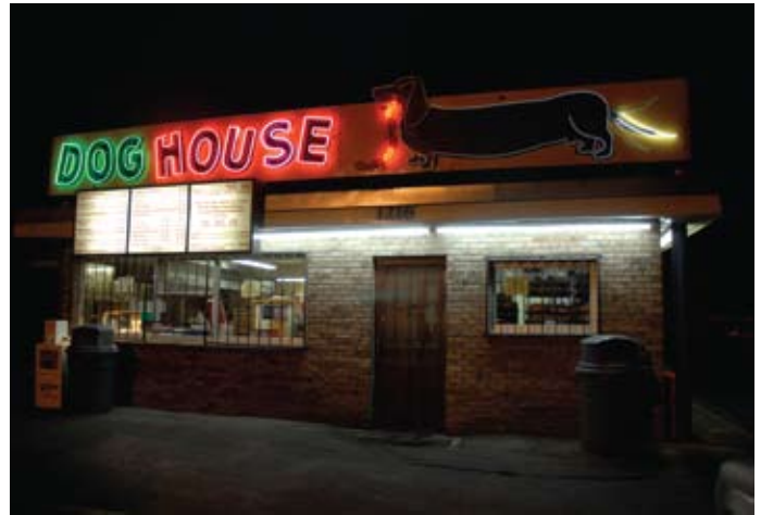
Dog House Drive-In 1216 Central Ave. SW, 243-1019, Monday–Saturday, 10 am–10 pm; Sunday, 11 am–10 pm